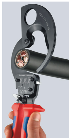
95 31 280: Large cutting capacity: maximum 52 mm dia. / 380 mm 2