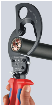
95 31 280: Large cutting capacity: maximum 52 mm dia. / 380 mm 2