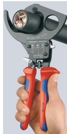
Ratchet principle and two-stage ratchet drive for easier cutting