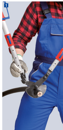
Setting of a favourable handle width