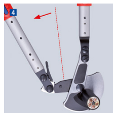
after the first partial cut, the handles open by ratchet action