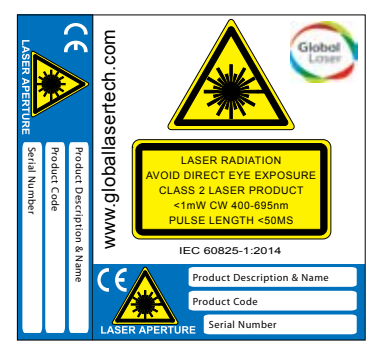
Class 2 Laser Label

Our Lasers are compliant to IEC60825-1 2014 standards. The lasers will fall within one of the following classifications depending on power, wavelength and fan angle. An example of the labels supplied with the units are shown below.