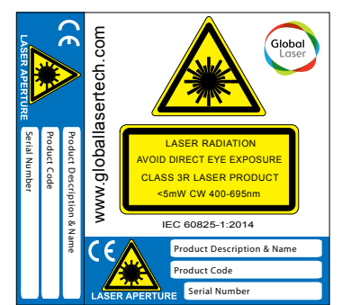
Class 3R Laser Label