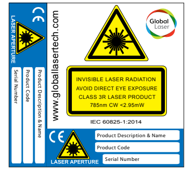
Class 3R 785 Laser Label