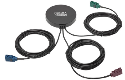
3-in-1 (4G/Wi-Fi/GPS) External Antenna