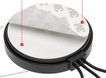
Flip-side of antenna housing