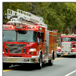
Fleet Management Systems for Commercial Vehicles

FAKRA Connectors (Blue: GPS, FAKRA Model C; Purple: 4G, FAKRA Model D; Green: Wi-Fi, FAKRA Model E)