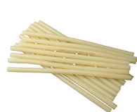
GF 260 High Strength No. 04043 - 1 lb 04044 - 11 lbs