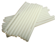
G 200C Clear Glue No. 04080 - 1 lb 04801 - 1 kg