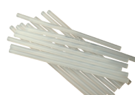
GF 23 Wood Glue No. 04034 - 1 lb 04035 - 11 lbs