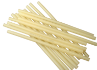
GF 14 Carton Glue No. 04040 - 1 lb 04041 - 11 lbs