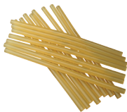
GF 213 Laminate Glue No. 04037 - 1 lb 04038 - 11 lb