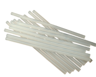
GF 232 General Purpose No. 04031 - 1 lb 04032 - 11 lb