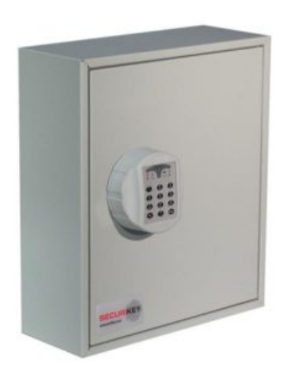
Deep System 48 Electronic Lock REVO A