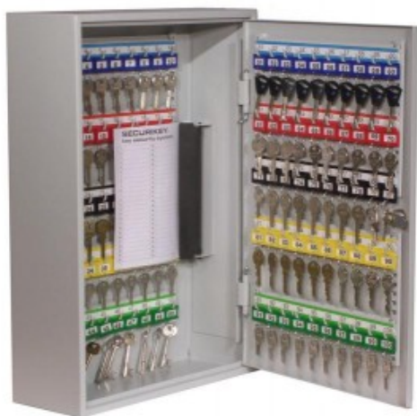
Deep System 100