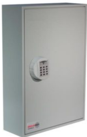
Deep System 100 Electronic Lock REVO A