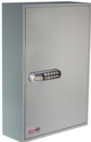
Deep System 100 Electronic Cam Lock CL1000