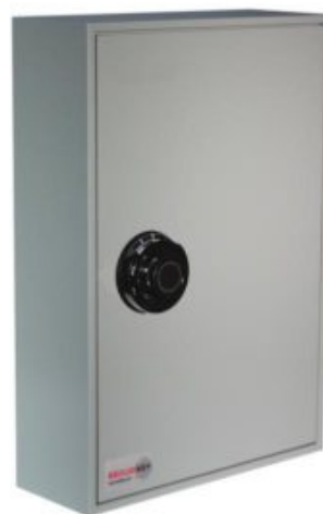
Deep System 100 Dial Combination Lock