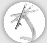
Adjustable viewing angle