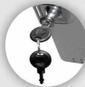
Anti-Theft lock with key