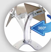
Rotates 360 degrees