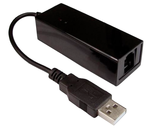
Professional v.92 Modem Solutions