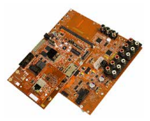
SABRE for Automotive Infotainment Based on i.MX 6 Series