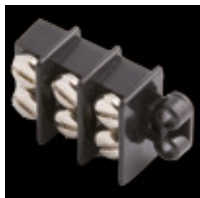
Twin Terminal 3 Way