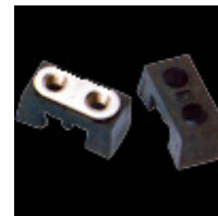
End Fix Cover