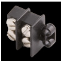
Twin Terminal 2 Way