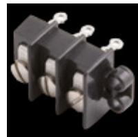
Drop-Through Solder Terminal 3 Way