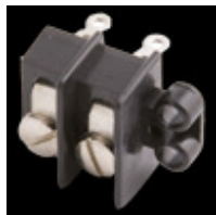
Drop-Through Solder Terminal 2 Way