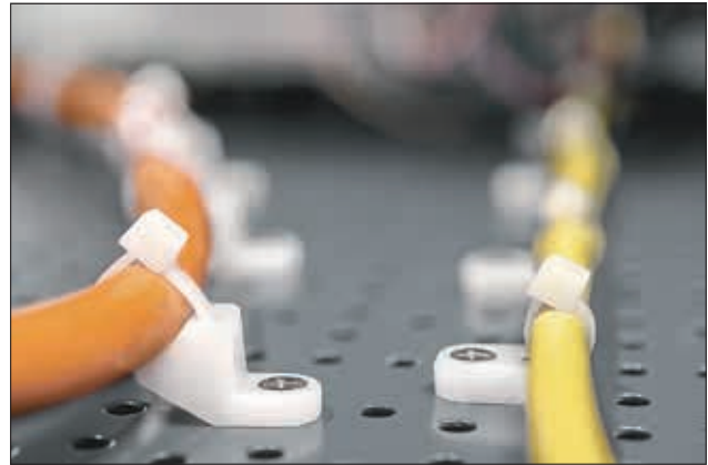
LKM, CL8 and FH cable tie mounts for applications with limited space.