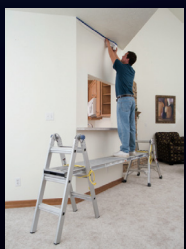
2 SCAFFOLD BASES