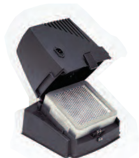
Filters are easy to remove and replace.