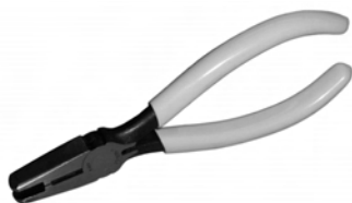
Economy hand tool Part number 790162-1