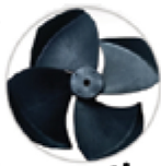
Innovative Fan Blade Design