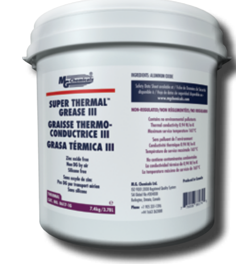
1 Gallon Pail