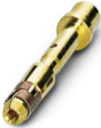
Crimp contact, turned, contact diameter: 1 mm, crimp range: 0.25 mm 2 ... 1 mm 2

Please be informed that the data shown in this PDF Document is generated from our Online Catalog. Please find the complete data in the user's documentation. Our General Terms of Use for Downloads are valid ( http://phoenixcontact.com/download )