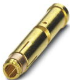
Crimp contact, turned, contact diameter: 2 mm, crimp range: 2.5 mm 2 ... 4 mm 2

Please be informed that the data shown in this PDF Document is generated from our Online Catalog. Please find the complete data in the user's documentation. Our General Terms of Use for Downloads are valid ( http://phoenixcontact.com/download )