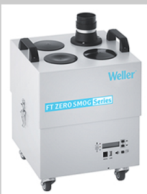
Solder fume extractors