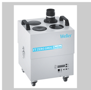
Solder fume extractors