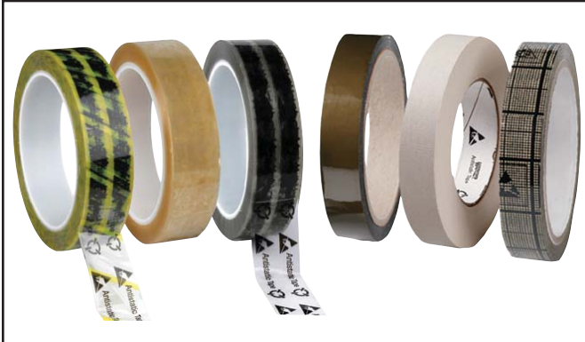
Wescorp ESD Tapes

In ESD protected areas, replace regular high charging tape with Wescorp ESD Tape. ANSI/ESD S20.20 section 8.3.1. states "All nonessential insulators, such as those made of plastics and paper (e.g., coffee cups, food wrappers and personal items) must be removed from the workstation."