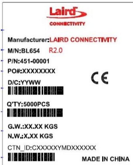
Figure 3: Master carton package label