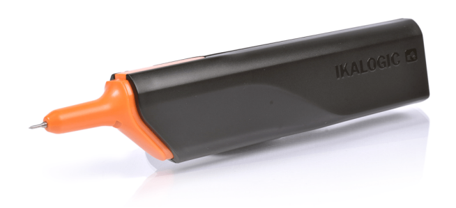
Figure 1: IkaScope WS200 ultra-portable oscilloscope

IkaScope WS200 is an ultra portable oscilloscope probe. It weighs less than 60g and is designed to fit perfectly in your hand. With a Wifi connection to a smartphone, a tablet or a computer, signals can be displayed and measurements can be easily made. Patented ProbeClick®technology transforms the probe tip into an intelligent part of the oscilloscope: The probe detects when pressure is applied or released, allowing measurement to be automatically started and stopped without the need of traditional RUN/STOP button.