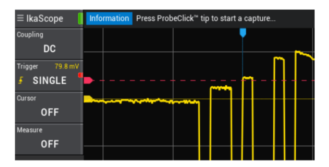
Figure 5: Ikascope application screenshot

Note : IkaScope device must be turned ON to be connected to a network. If all LEDs are switched OFF, please turn ON IkaScope by pressing on the probe tip for 1 second. Finally, press IkaScope probe tip on the pad where an electric signal needs to be measured. You should hear a "click" sound, and feel a vibration in the device: This means that data is being streamed to the application. Keep the pressure on the tip until you see signals appearing in the application (This can take between 100 and 800 milliseconds).