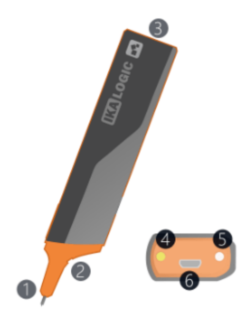
Figure 3: IkaScope WS200 interfaces

IkaScope WS200 ports and interfaces are shown in the image below: