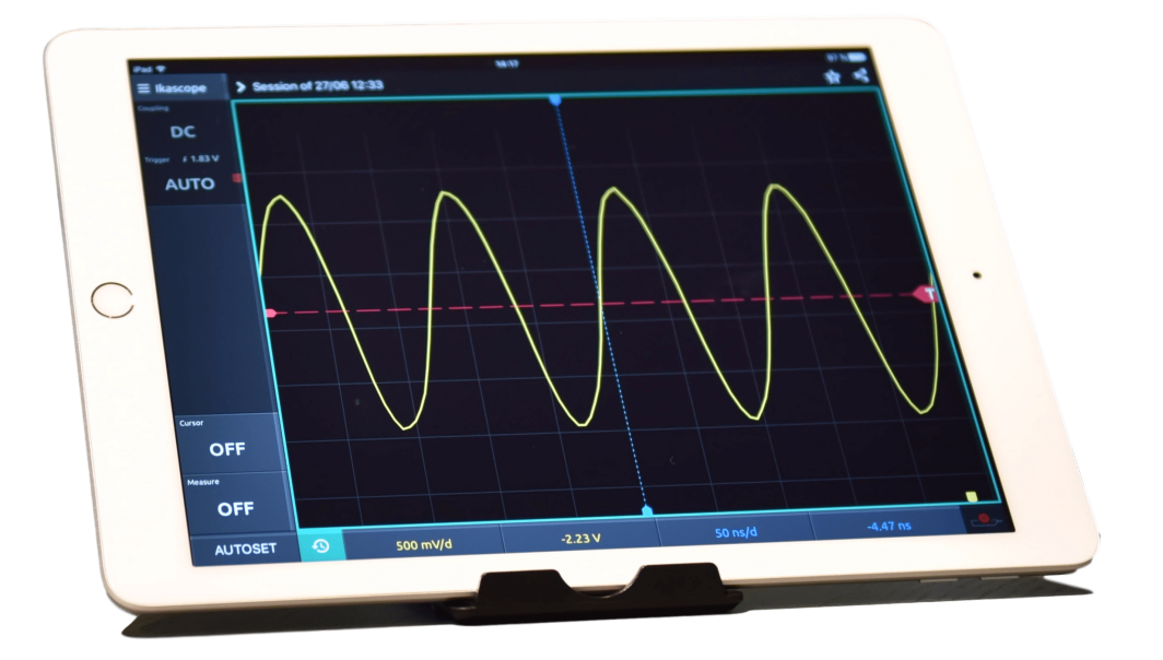
Figure 2: IkaScpoe software running on a tablet