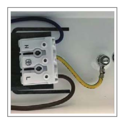
Screwless Terminal Block