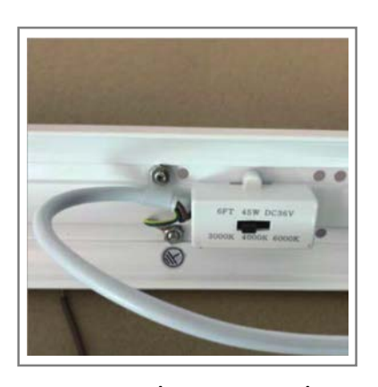
Internal CCT Switch