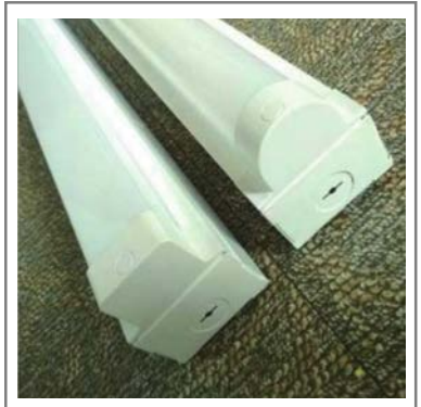
square or round polycarbonate diffuser