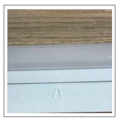
3 x pinch points for easy removal of diffuser