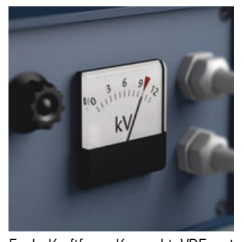
Each Kraftform Kompakt VDE set has been tested individually at 10,000 volts, in accordance with IEC 60900.This ten-times-higher testing load guarantees safe working at their maximum permitted load of 1,000 volts.