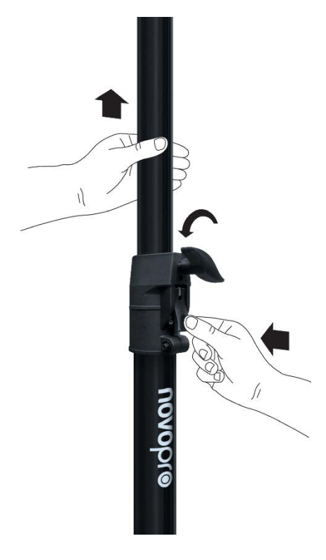
Auto-lock ratchet and air cushioning system for safe & easy operation

The Novopro LIG300 lighting stand has been designed for ease of use as well as safety. The stand has the patented auto-lock ratchet and air cushioning system which allows you to adjust the height and lock the stand to that height without the usual slipping and inconvenience of standard lighting stands.