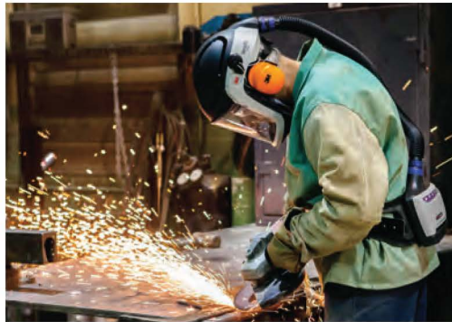
Image shown with optional integrated earmuffs and HE filter.

For rugged operations such as industrial, demolition, grinding, metal finishing and casting, the Heavy Industry Kit (TR-600-HIK) features M-307 Hard Hat Assembly Headtop, TR-6530N Combination Cartridge (HE/OV/AG), TR-632 High Capacity Battery