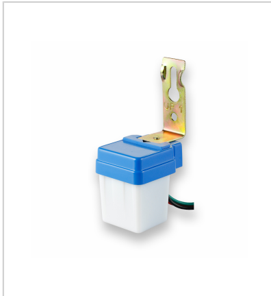
VT-8019 PHOTO CELL SENSOR