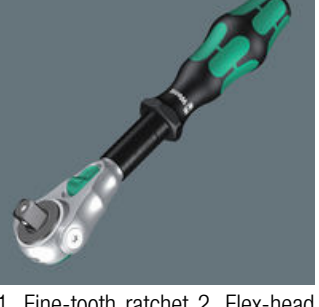
1. Fine-tooth ratchet 2. Flex-head ratchet 3. Angle ratchet 4. Quick-release ratchet 5. Power ratchet 6. Screwdriver