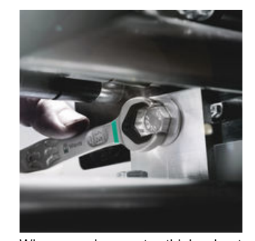
When we began to think about open-ended wrenches, we asked ourselves: why does the wrench always have to be flipped over; why does it have an offset design; why does it slip off injuring fingers? The new design of the mouth resulted in a real "Joker" that works even when all other trumps have been played.