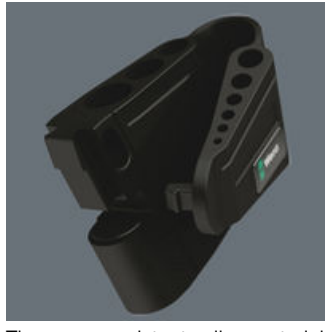
The wear-resistant clip material ensures that the L-keys are securely held yet are easy to remove.