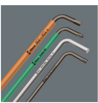
The size of each L-keys has been engraved by a laser. In addition Take it easy L-keys have a colour coding according to sizes - for simple and rapid accessing of the required tool. Making it easy to find the right tool.