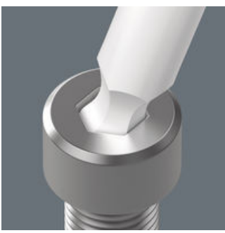
The spherical drive profile means that it is possible to swivel the axis of the tool to that of the screw, and therefore enable angled, "around-the-corner" screwdriving jobs.