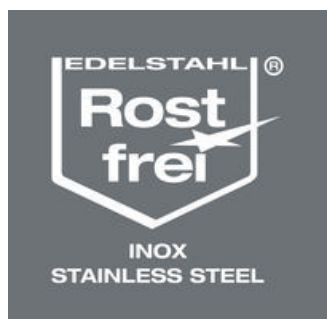
Stainless L-keys are hardened to the same strength as conventional (carbon) steel tools, and prevent extraenous rust forming.