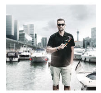
We questioned the classic L-key design, since all too often the screw head recess is rounded out, meaning screws can no longer be tightened or loosened – and so the user finds the L-key slipping out of the recess. Wera Hex-Plus tools have a larger contact surface in the screw head. The notching effects are reduced and thereby the deformation of the screws. At the same time, as much as 20 % more torque can be applied.