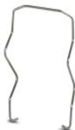
Relay retaining bracket, wire model, suitable for RIF-2 relay base

Please be informed that the data shown in this PDF Document is generated from our Online Catalog. Please find the complete data in the user's documentation. Our General Terms of Use for Downloads are valid ( http://phoenixcontact.com/download )