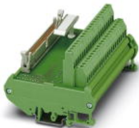
VARIOFACE interface module for 32 channels

Please be informed that the data shown in this PDF Document is generated from our Online Catalog. Please find the complete data in the user's documentation. Our General Terms of Use for Downloads are valid ( http://phoenixcontact.com/download )