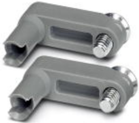
Replacement cable guide 0,75 mm 2 , for sleeve feed CF 3000 HZG 0,75

Please be informed that the data shown in this PDF Document is generated from our Online Catalog. Please find the complete data in the user's documentation. Our General Terms of Use for Downloads are valid ( http://phoenixcontact.com/download )