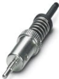
Service tool, for CF-CRIMPHANDY 1,5, for rectifying malfunctions

Please be informed that the data shown in this PDF Document is generated from our Online Catalog. Please find the complete data in the user's documentation. Our General Terms of Use for Downloads are valid ( http://phoenixcontact.com/download )