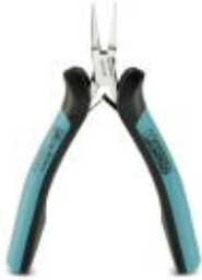
Electronic flat pliers, smooth gripping surface, with spring opening

Please be informed that the data shown in this PDF Document is generated from our Online Catalog. Please find the complete data in the user's documentation. Our General Terms of Use for Downloads are valid ( http://phoenixcontact.com/download )