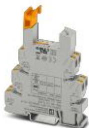
14 mm PLC basic terminal block without relay, for mounting on DIN rail NS 35/7,5, Push-in connection, 2 PDT, Input voltage 120 V AC/DC

Please be informed that the data shown in this PDF Document is generated from our Online Catalog. Please find the complete data in the user's documentation. Our General Terms of Use for Downloads are valid ( http://phoenixcontact.com/download )