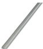
Continuous plug-in bridge, length: 500 mm, color: gray

Continuous plug-in bridge - FBST 500-PLC GY - 2966838