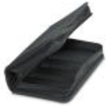
Tool box, unequipped

Tool bag, unequipped - TOOL-KIT STANDARD EMPTY - 1212423