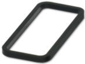
Replacement profile gasket for HC-D15 sleeve housing

Please be informed that the data shown in this PDF Document is generated from our Online Catalog. Please find the complete data in the user's documentation. Our General Terms of Use for Downloads are valid ( http://phoenixcontact.com/download )