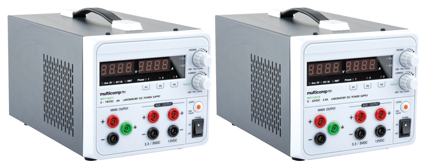
MP710077 & MP710077 US