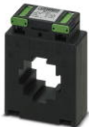
Window-type current transformer, 250 A AC primary current; 5 A AC secondary current; accuracy class 1; 5 VA rated power

Please be informed that the data shown in this PDF Document is generated from our Online Catalog. Please find the complete data in the user's documentation. Our General Terms of Use for Downloads are valid ( http://phoenixcontact.com/download )