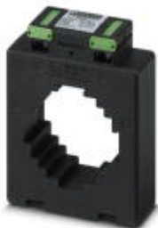
Window-type current transformer, 200 A AC primary current; 5 A AC secondary current; accuracy class 1; 2.5 VA rated power

Please be informed that the data shown in this PDF Document is generated from our Online Catalog. Please find the complete data in the user's documentation. Our General Terms of Use for Downloads are valid ( http://phoenixcontact.com/download )