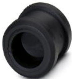
Filler plug to close the unused openings of the HC-KD/SG-... conduit

Please be informed that the data shown in this PDF Document is generated from our Online Catalog. Please find the complete data in the user's documentation. Our General Terms of Use for Downloads are valid ( http://phoenixcontact.com/download )