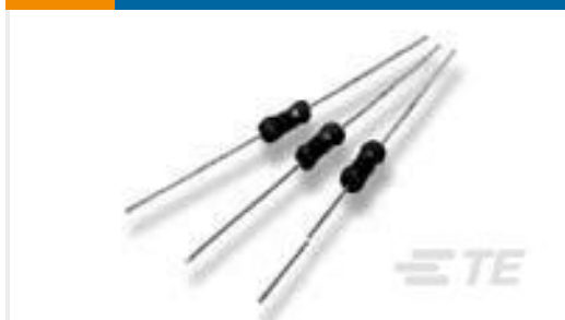
TE Model / Part #3-1879354-0 RR03 5% 5R1 AMMO