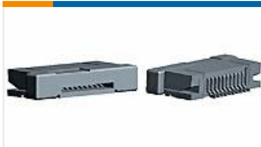
TE Model / Part #2-1734592-1 FPC CONN. 0.5MM PITCH B/C, 21P