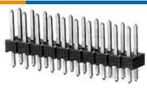
TE Model / Part #6-146253-3 26 MODII HDR DRST B/A . 100CL LF