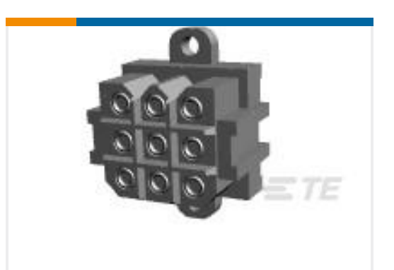
TE Model / Part #207526-9 SKT HDR ASSY,9P,MMATE LF