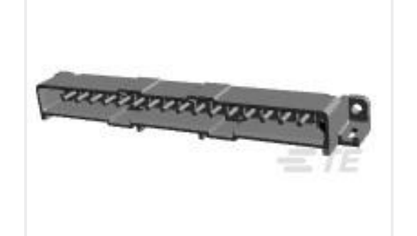
TE Model / Part #207599-6 MMATE PIN HDR ASSY, 16P LF