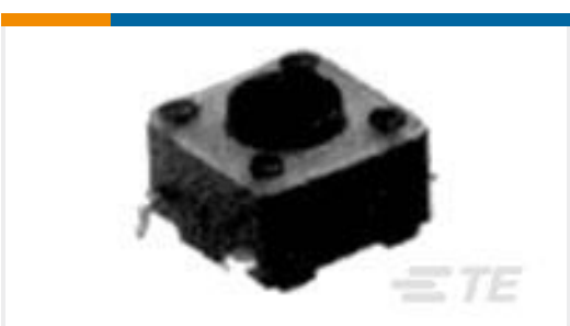
TE Model / Part # 3-1437565-0 FSM2JSMATR=ON T/R