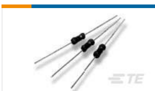
TE Model / Part #3-1879352-0 RR02 5% 5R1 AMMO