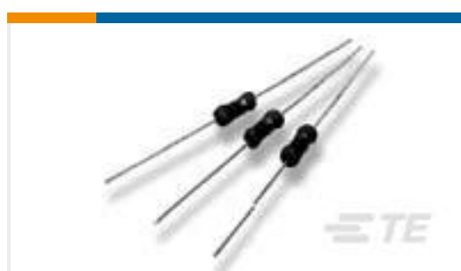
TE Model / Part #5-1879354-2 RR03 5% 43R AMMO