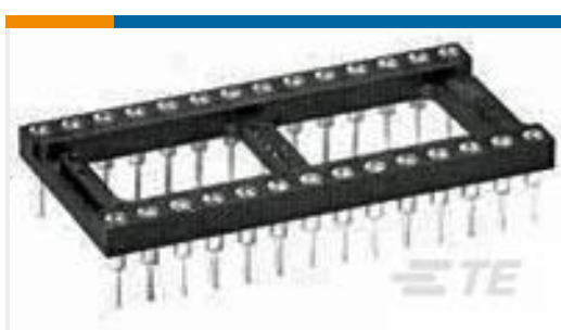
TE Model / Part #1571552-2 808-AG12D-ES-LF=800 DIP,SN/SN