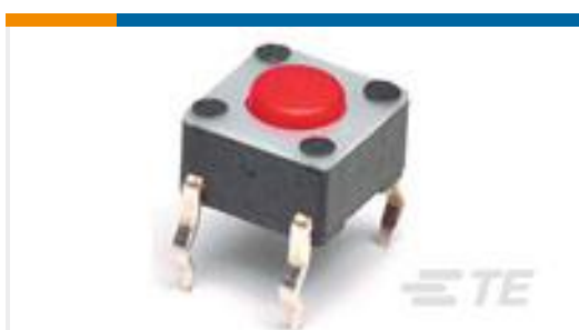
TE Model / Part # 2-1825910-7 FSM14JH=6MM TACT SWITCH, HIGH TEMP