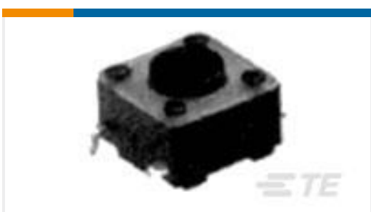
TE Model / Part # 4-1437565-2 FSM4JSMATR=TACT SWITCH 6X6MIL