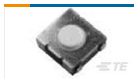
TE Model / Part #1571625-5 TACT,6X6,SMT,J-LEAD, 160GF