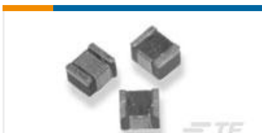
TE Model / Part #4-1624112-2 3650 0402 11nH 5% 2K RL