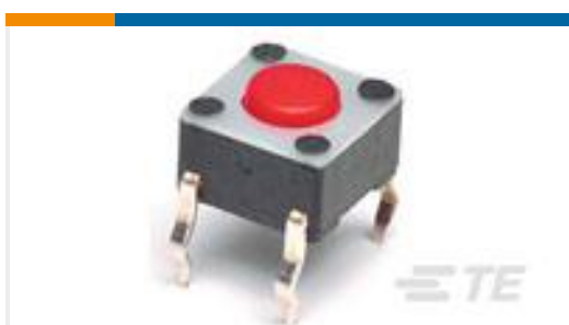
TE Model / Part # 1825910-6 FSM4JH=6MM TACT SWITCH, HIGH TEMP