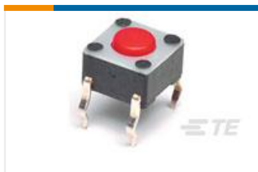
TE Model / Part # 2-1825910-7 FSM14JH=6MM TACT SWITCH, HIGH TEMP