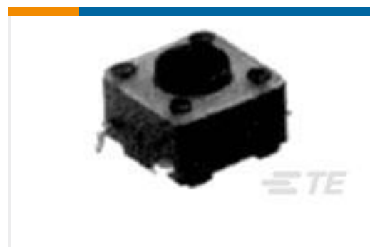
TE Model / Part # 3-1437565-0 FSM2JSMATR=ON T/R