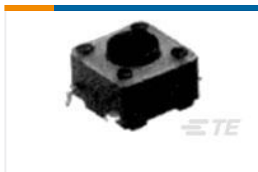
TE Model / Part # 4-1437565-2 FSM4JSMATR=TACT SWITCH 6X6MIL