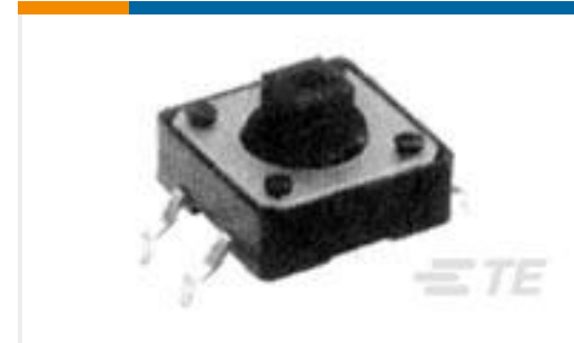
TE Model / Part #1571627-1 FSM103A=TACT SWITCH, 260G