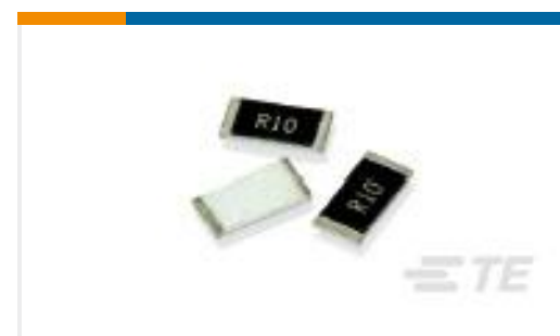
TE Model / Part #2- 2176057-9 RLP73K 3A R15 1% 1K RL