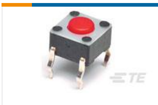
TE Model / Part # 1825910-6 FSM4JH=6MM TACT SWITCH, HIGH TEMP