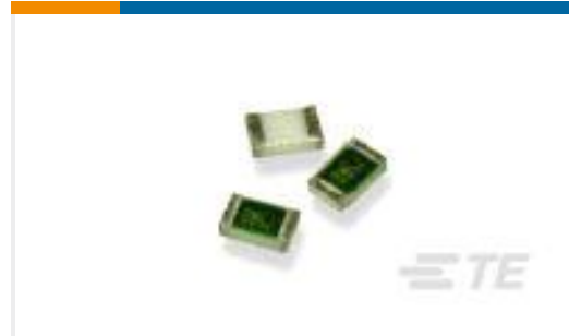
TE Model / Part #2- 1879224-2 CPF 0603 4K99 0.1% 25PPM 1K RL