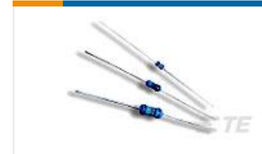
TE Model / Part #4- 1879026-0 YR1 0.1% 24R9